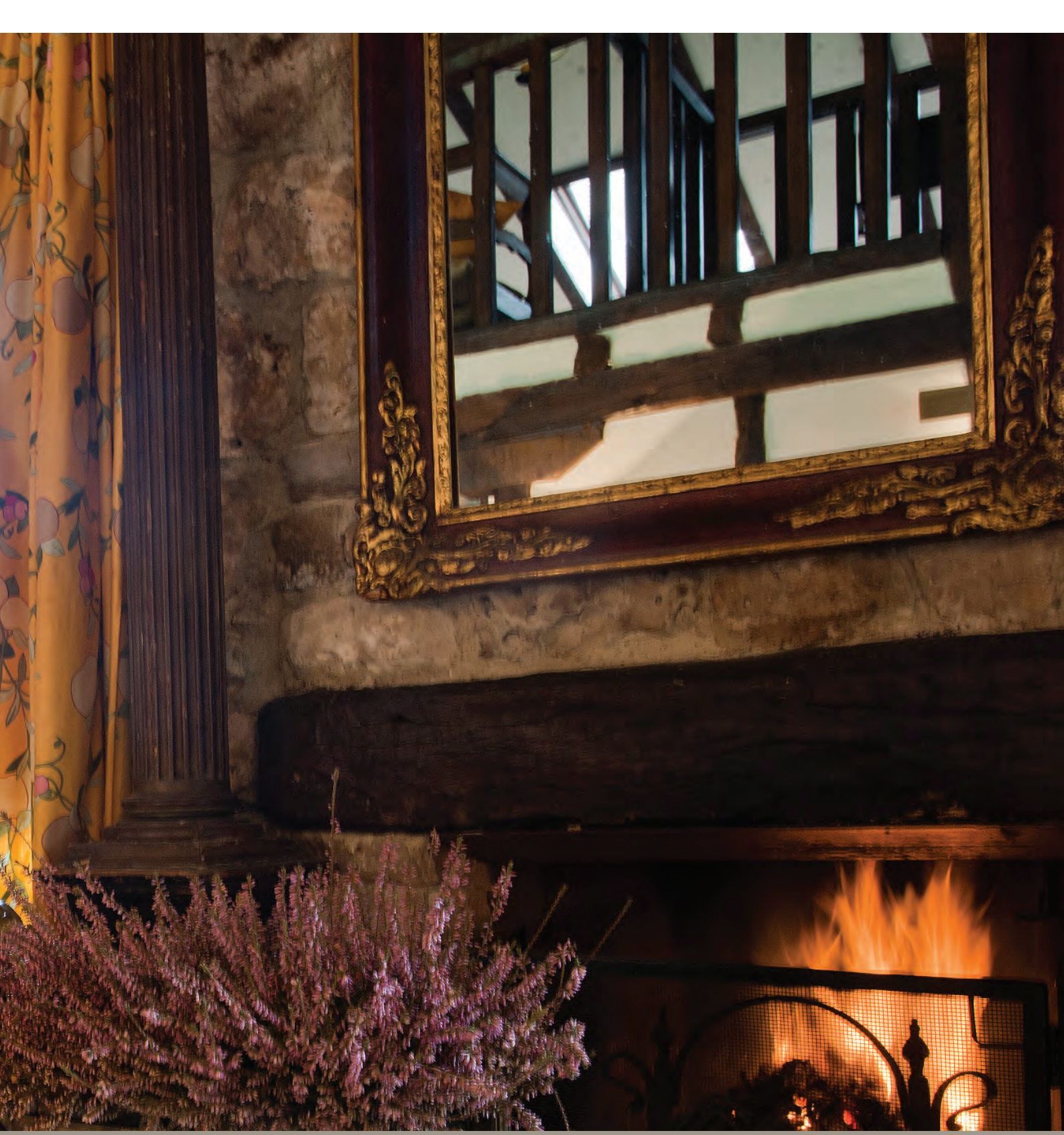
TE CHENTO 3 · CHARMING HOUSES & LIFESTYLE