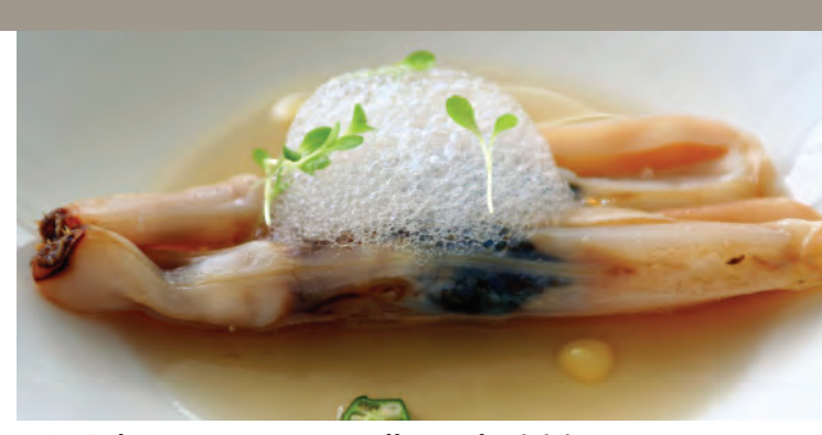
3. Other restaurants well worth visiting...

Web. http://www.restaurantealameda10.com