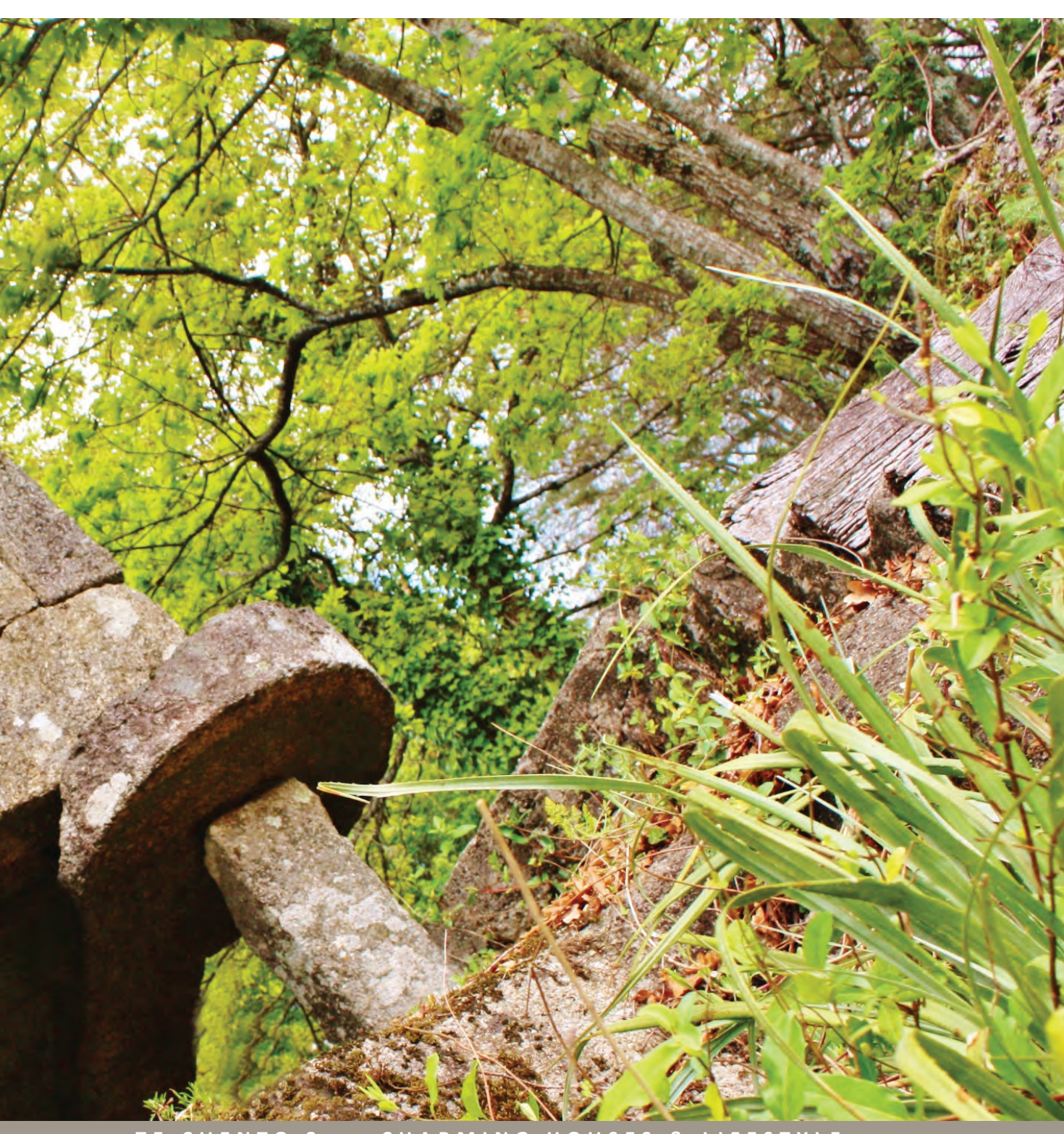
TE CUENTO 3 · CHARMING HOUSES & LIFESTYLE